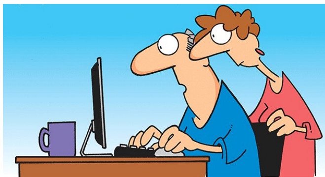
“The computer says I need to upgrade my brain to be compatible with the new software.”

DO NOT Download and Install Driver Update Software from any source.