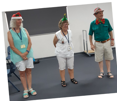
Buderim Christmas Hat Competition Entrants